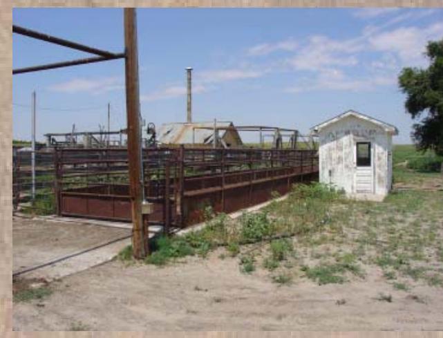
70' Scale with Electronic Reader

The bunk house is located near the main house and the building which accommodates the ranch office also shares the same yard. These improvements were carefully built during the ranch's prime years of operation, with details reflecting an ingenuity of design that met the needs of the occupants of this Sand Hills ranch.