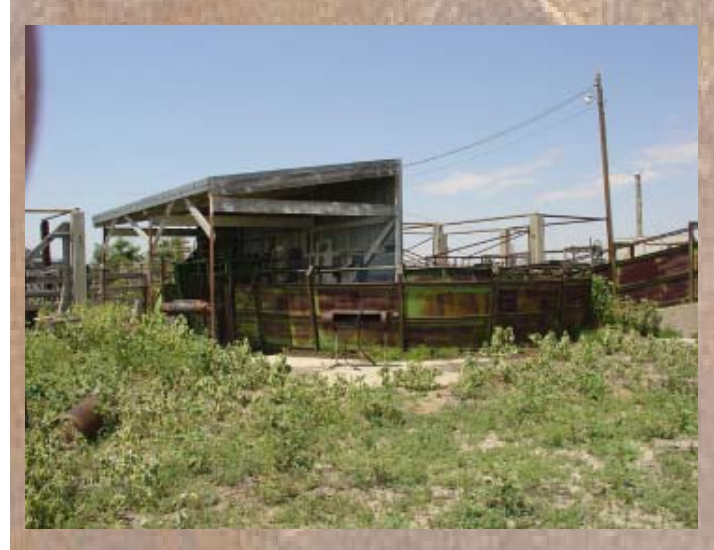
Tub & Hydraulic Chute